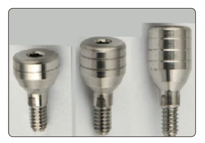
For immediate gradual loading group (at surgery time group A received 2mm height gingival former which was swapped by,3mm and finally 4mm).

For the early loading group (group B). The implants remain with the 2mm height gingival former from the surgery time till loading time six weeks later.