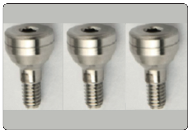
For the early loading group (group B). The implants remain with the 2mm height gingival former from the surgery time till loading time six weeks later.