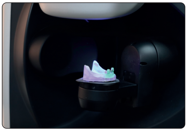
Fig. (2): Scanning of Cobalt chromium bar-abutment assembly