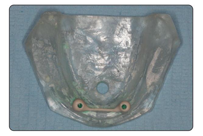
Fig. (5): Finished CAD-CAM milled PEEK bar-abutment assembly screwed on model