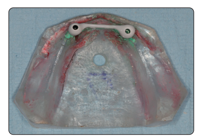
Fig. (4): Finished CAD-CAM milled zirconia bar-abutment assembly screwed on model.