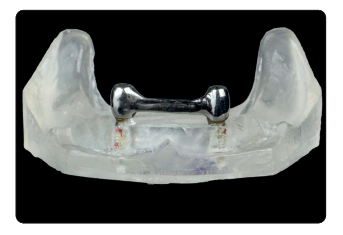
Fig. (1): Cobalt chromium bar-abutment assembly

All the Co-Cr bar-abutment assemblies were then scanned (inEos X5 Dentsply Sirona) to be used as a blueprint for fabrication of zirconia and PEEK bars (Fig. 2). The 3D images of the scanned bars were checked for accuracy (Fig. 3). For the zirconia bar attachment group, the bar-abutment assembly were milled using a milling unit machine (Zirconzahn, Milling unit M1) then, they were sintered using a sintering furnace (Zirconzahn 600/v2) at 1600° for 12 hours. The finished zirconia bar-abutment assemblies were then screwed on the models as shown in figure 4. For the PEEK bar attachment group, the same steps were repeated, then the PEEK bar-abutment assemblies were milled and screwed directly on the models (Fig. 5).