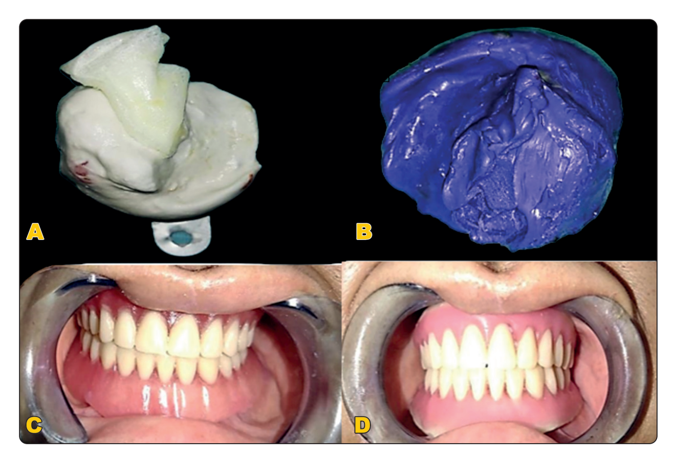
Fig (1): Construction of definite obturator :(a) primary impression, (b) secondary impression,(c) try in, (d) delivered definite obturator