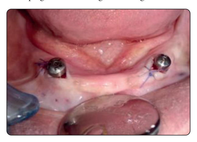
Fig (1): Healing abutments

One week later an open tray impression technique was done by using long impression copings after removing the healing abutments.