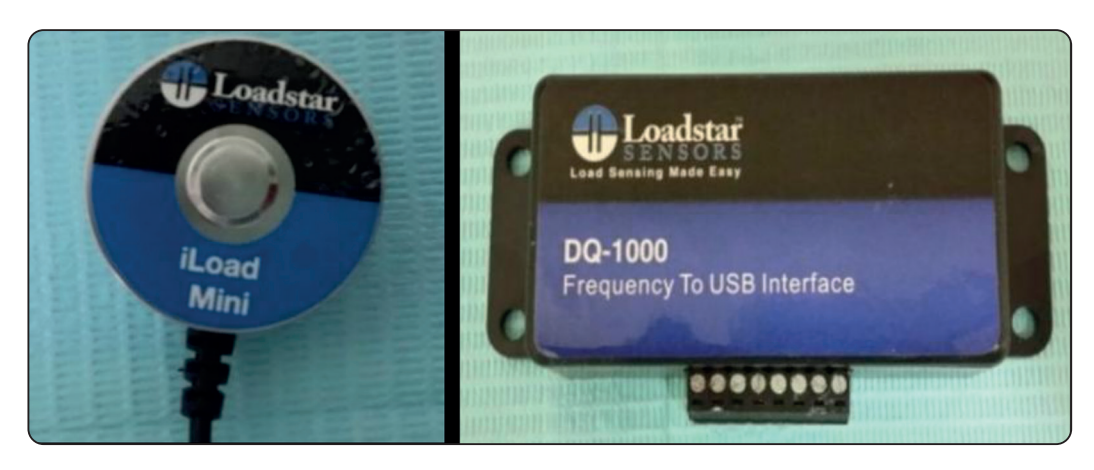
Fig (4): The I-load star sensor device.