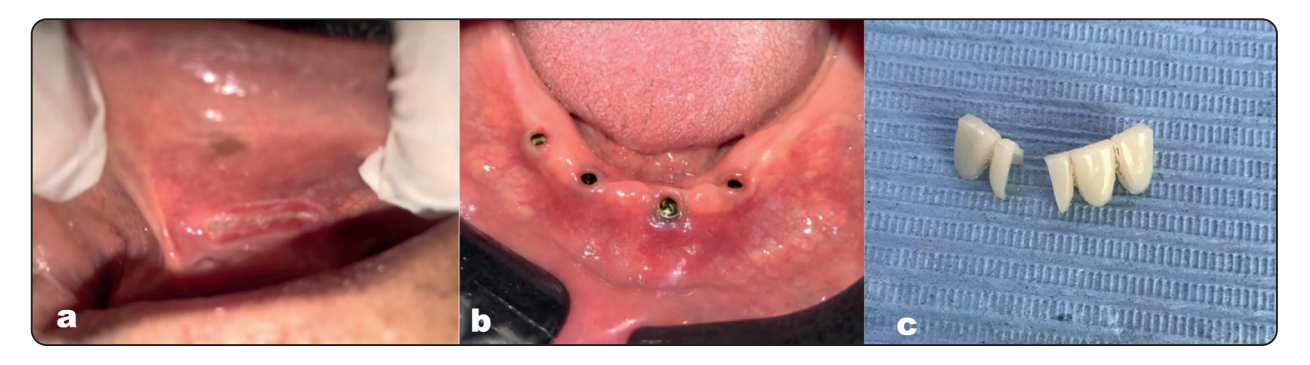
Fig. (3): a) an upper arch flabby ridge; b) periimplantitis; c) a crown fracture