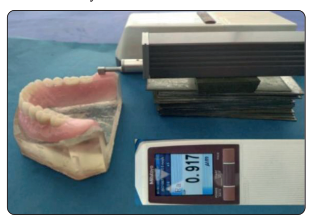
Fig. (7) Measuring the surface roughness for the acrylic dentures

All the data were measured, collected, tabulated and statistically examined.