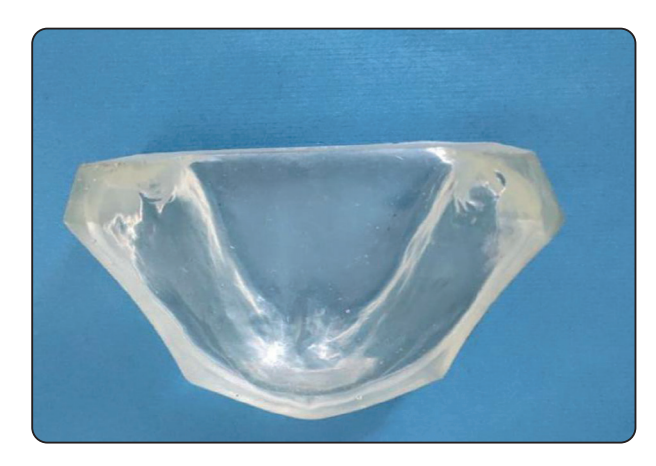
Fig. (1) A ready-made Epoxy model of completely edentulous ridge.

A ready -made Epoxy model of mandibular completely edentulous ridge was used in that study. (Fig. 1).