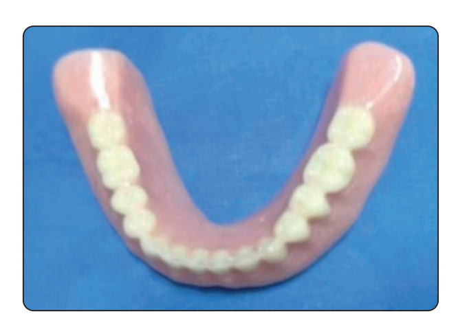
Fig. (5) Finished and polished denture

(2912) E.D.J. Vol. 69, No. 4 Aml Shafik, et al.