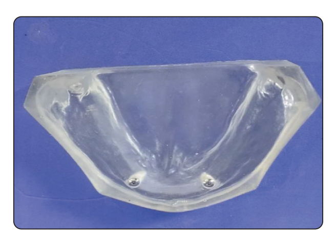
Fig. (2) The two implants were fixed at the mandibular canine region

Two identical internal hex implants (3.5 mm diameter and 10 mm length, Neobiotic Co., Ltd., GURO 10F, E-space Bldg., 36, Digital-ro 27 gil, Guro-gu, Seoul, 08381, Republic of Korea) were inserted in the canine region perpendicular to the residual ridge area bilaterally (Fig. 2).