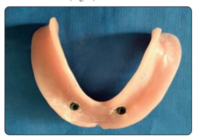
Fig. (6) Picking up the metal housing

The nylon caps and steel housing were located over the ball abutments. Enough clearance was ensured at the fitting surface of the dentures. Petroleum jelly (Vaseline) was applied to the model. Small two holes were drilled at the lingual surface of the overdenture opposite each ball. The overdentures were seated over the model to pick up the two ball abutments using self-cure acrylic resin at the dough stage. Pressure was applied until the acrylic resin was completely cured. After the complete setting of the acrylic resin, the excess acrylic was removed and then finished (Fig. 6).