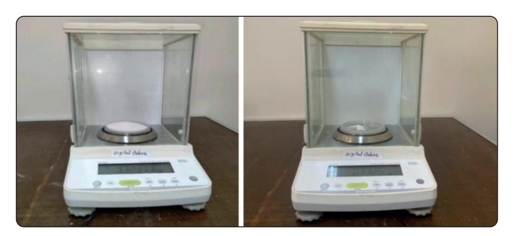
Fig. (4) (Measuring the powder of PMMA and Salinized Tio2 Nps using Digital Balance)

The Epoxy model with the implant installed was duplicated using the duplicating material to produce the casts used in the construction of the dentures. Two sheets of pink base plate wax were applied to the stone cast, and the setting up of teeth was done. In Group A, the dentures were made of PMMA only. In Group B, the dentures were made of PMMA modified by Salinized Tio2 Nps. For group B, the Salinized TiO2 NPS powder was added to the acrylic monomer and mixed. The acrylic powder was added to that mixture, and mixing continued until a consistent mixture was obtained. Flasking, packing, curing, finishing, and polishing were done for all dentures according to manufacturing instructions (Fig. 5).