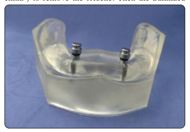
Fig. (3) The two ball and socket attachments

Tio2 NPS powder was mixed with Toluene in a container. Then the mixture was sonicated using an ultrasonic probe (cleaner). After that, 3-aminopropyl triethoxysilane (APTS) was added to that mixture. After 48 hours, that mixture was placed in the Evaporator (Dlab scientific Co., Ltd.RE100 -S, china) to remove the toluene. Then the Salinized