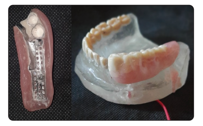
Fig. (2) Removable partial denture retained with Peek telescopic attachment

A unilateral metal partial denture was fabricated by the conventional method, and a PEEK abutment was incorporated into the acrylic denture base using self-polarized acrylic resin. Figure 2]