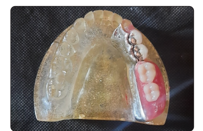
Fig. (1) Removable partial denture with lingual ledge retained with extracoronal attachment

After sealing the space under the matrix of the attachment with utility wax, putty and an adition silicone material (Zetaplus, Zhermach, Germany) were used to create a two-step impression for casting. The impression was Type III hard rock. The resulting casting was modified by applying a relief and blocking out the wax to produce a modified casting which was then replicated into a refractory casting. A wax model of the metal framework was made using contour wax (Wax Model, Bego, Bremen, Germany) on a refractory mold. This pattern was created to cover the edentulous area and extend lingually to the lingual ridge of the cement-retained bridge. I attached the female part of the attachment made in advance to the position of the male part, attached it to the wax model, and soldered it together to the metal frame. The final metal framework was obtained following traditional casting procedures. Figure 1]