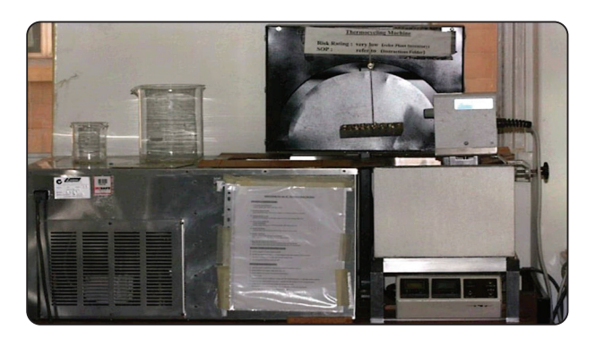
Fig. (1) Thermocycling machine

During testing, a thin layer of tin foil (0.5mm) was inserted between the steel sphere and the crown to help disperse the force and prevent excessive pressure from being applied to the resin composite crown surfaces. The force was evaluated in newtons, and averages were then determined for each classification. The nature of the breakdown was deduced from an examination of the broken pieces. The teeth were also sectioned along the middle so that any coronal leaking could be examined.