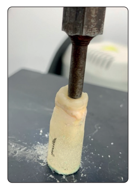
Fig. (3) Fracture Resistance testing using