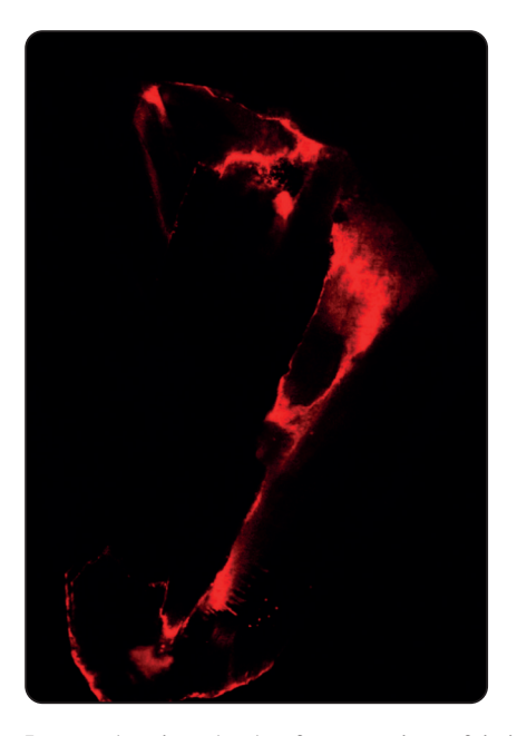
Fig. (2): Image showing depth of penetration of irrigant in Group (2), Subgroup (A) (6% taper, without activation)

Numerical data was represented as mean and standard deviation (SD) values. Shapiro-Wilk's test was used to test for normality. Homogeneity of variances was tested using Levene's test. Data showed parametric distribution and variance homogeneity and were analyzed using two-way ANOVA. Comparison of simple main effects was done utilizing the error term of the two-way model with p-values adjustment using Bonferroni correction. The sig-