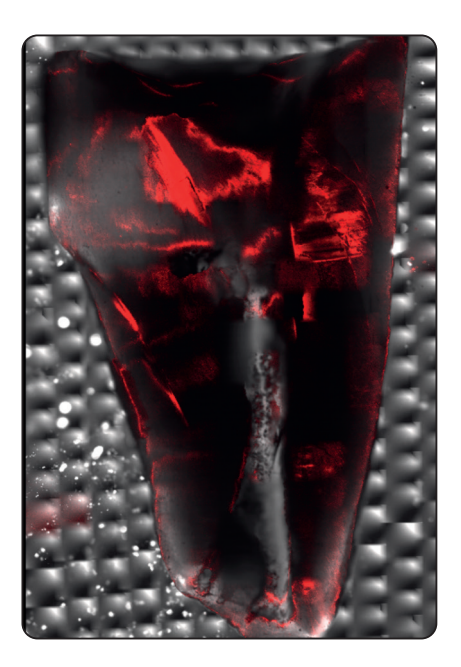
Fig. (4) Image showing depth of penetration of irrigant in Group (2), Subgroup (B) (6% taper, with activation)

Results of two-way ANOVA are presented in table (1). They showed that there was a significant interaction effect between file taper and activation on penetration depth (p<0.001). Comparison of simple main effects are presented in table (2). Within activated and non-activated samples, files with taper (6%) had significantly higher penetration depths (p<0.001). For taper (4%), activation had no significant effect (p=0.088), while for taper (6%) samples, significantly higher penetration was achieved with activation (p<0.001). Mean and standard deviation values for penetration depth in different variables are presented in figures (5) and (6).