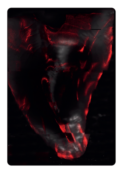
Fig. (3) Image showing depth of penetration of irrigant in Group (1), Subgroup (B) (4% taper, with activation)

nificance level was set at p<0.05 within all tests. Statistical analysis was performed with R statistical analysis software version 4.3.0 for Windows<sup>*</sup>.