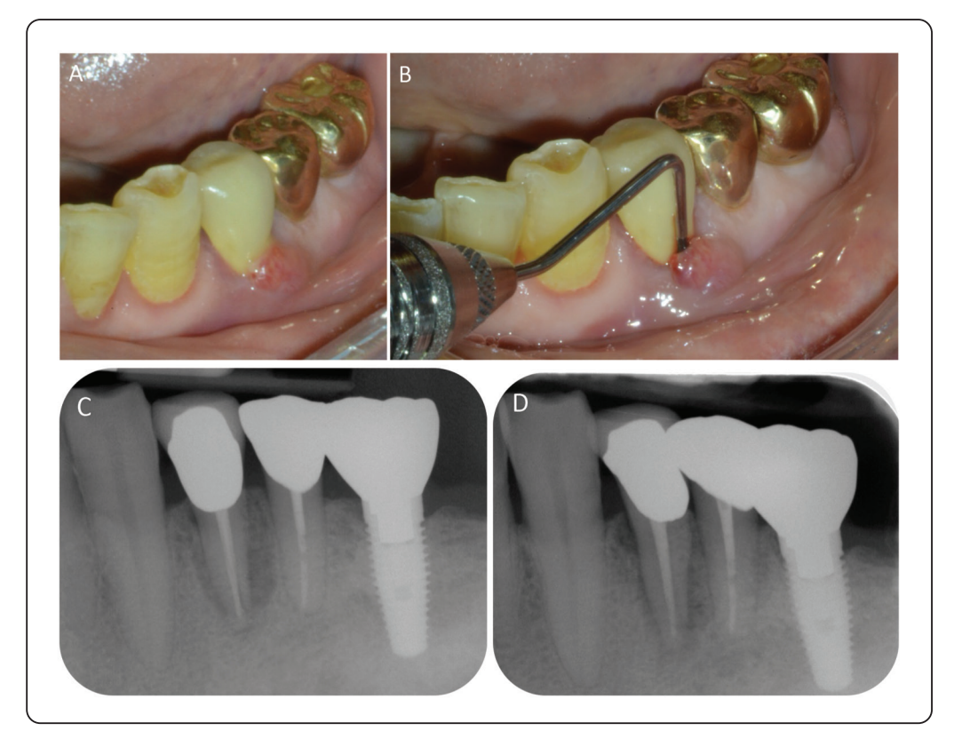
Fig. (2) (A) Clinical image showing buccal swelling related to tooth #34. (B) Signs of occlusal wear. Periodontal probing revealed a deep pocket mid-buccally, reaching the root apex. (C) Periapical radiograph showing a pear-shaped periradicular radiolucency related to tooth #34. This radiograph also shows black lines in the apical third (indicating vertical root fracture) of the same tooth. (D) A radiograph from different angle showing the same black line in the apical third of tooth #34.