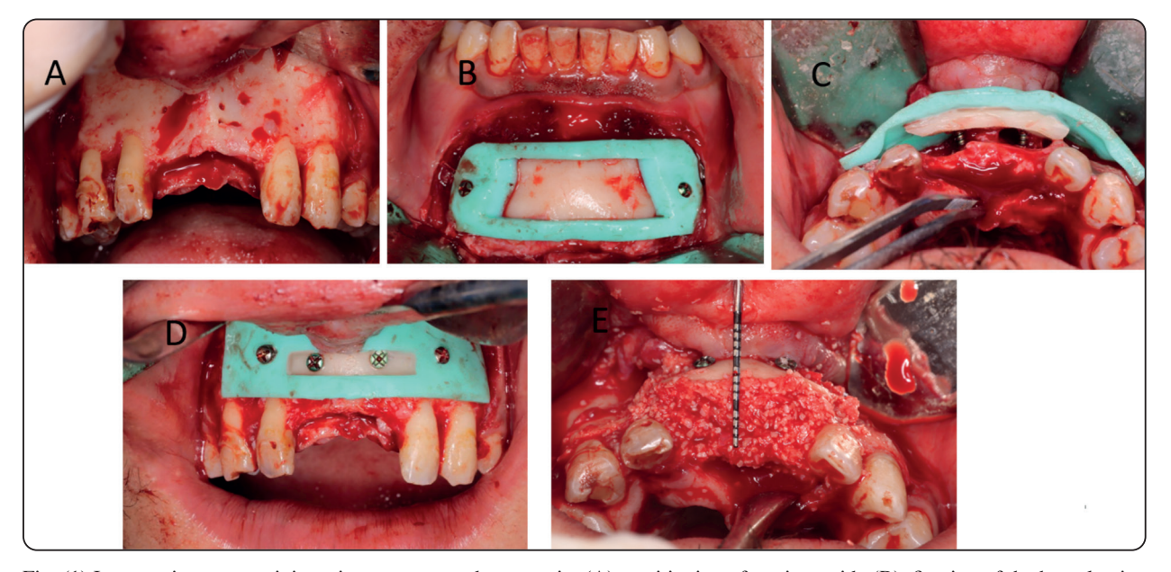
Fig. (1) Intervention case recipient site exposure and preparation(A), positioning of cutting guide (B), fixation of the bone lamina in the defect area with gap maintained(c), frontal view for fixed guide(D), amount of final bone gained(E).

Then the harvested cortical lamina was attached to the second guide and all the assembly was anchored into the recipient site using 2 screws. Finally the cortical lamina screwed into the atrophic ridge creating box shape was filled with bone particles (autogenous bone collected from the same donor site mixed with Xenogenic bone in 1:1 ratio) after removal of fixing guide and sharp edges smoothening (fig1).