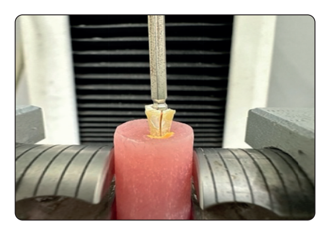
Fig. (1): Fracture resistance test setup.

simulate periodontal ligament. To guarantee vertical alignment of the long axis of the root, a protractor was used. The blocks were then mounted on the lower immovable partition of the Instron testing machine (Model 3345; Instron, UK). Over the canal opening of each root, a 5kN vertical force was applied. Force was increased by using a cylindrical steel rod with round tip, and a diameter of 2 mm being attached to the upper part of the universal testing machine at a rate of 1.0 mm/min, until the root was fractured. This point of fracture was documented by the computer monitoring software (BlueHill, Instron) and measured in Newton as shown in figure (1).