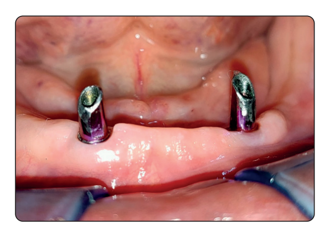
Fig. (1) Primary copings of telescopic attachments.

laboratory scanner then 3d printed in castable resin which in turn casted into Co-Cr alloy<sup>29</sup>. Fig. (2)