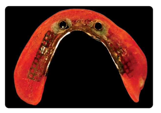
Fig. (2) Mandibular telescopic Overdenture