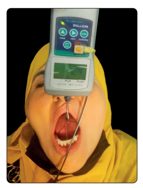
Fig. (3) Measurement of retention by force gauge

Retention measurement was made while patients were sitting in an upright position and their heads supported by the head rest in order to keep their mandibular occlusal plane parallel to the floor. Upward pull was made while patient is in this position until denture dislodgement occurs. The force needed for vertical dislodgement was recorded in Newton, measurement was made three times and average was taken. Fig.3