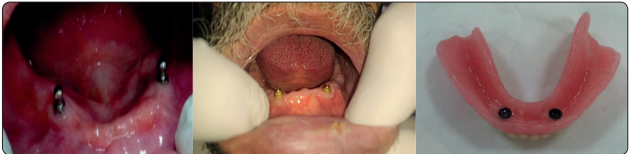
Fig. (1) A, stud attachment , B. locator attachment , C: metal housing for locator attachment.

Selective grinding step was performed intraorally with ordinary articulating paper method in order to create bilateral balance occlusion besides checking the center of force (COF) and trajectory line by the T-scan III *