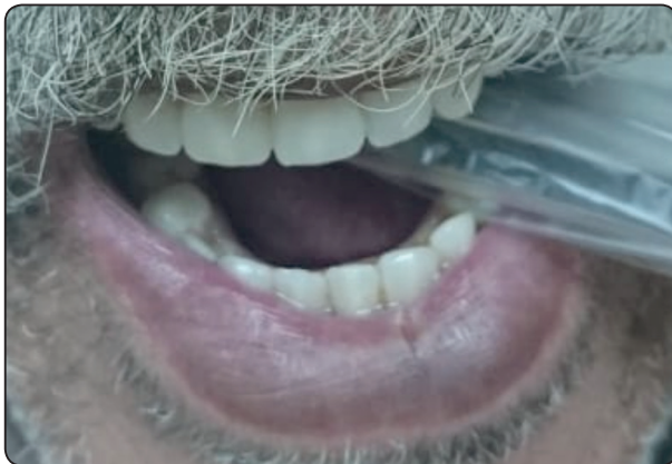
Fig. (3) Biting force measurement with load star sensor

The measurements was done at time of prosthesis insertion, 3 months, 6 months, 9 months and 12 months after denture insertion.