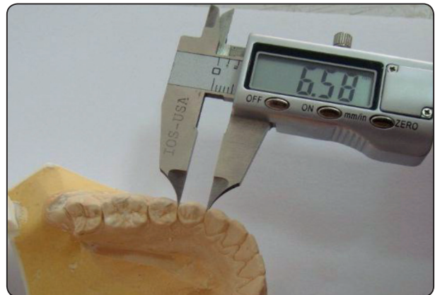
Fig. (1) Mesiodistal width measurement of posterior teeth.

In each malocclusion group, hypothetical tooth extractions were performed on each subject in the following 4 combinations: (1) all first premolars,