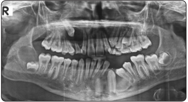
Fig (5) b) Post-operative panoramic radiograph showing the eruption of maxillary and mandibular canine after cyst marsupialization and the appearance of a new cystic lesion related to mandibular right third molar