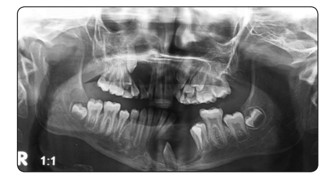
Fig (5) a) Preoperative radiograph showing impacted mandibular right canine and maxillary right canine