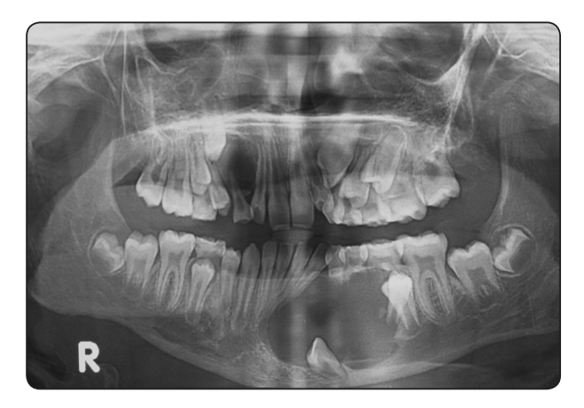
Fig (2) panoramic radiograph showing cystic lesion related to impacted maxillary right canine and impacted mandibular left canine.

The treatment of Gorlin-Goltz syndrome is the specific therapeutics of its clinical manifestations. In the case of odontogenic keratocysts, there are different treatment techniques to eliminate them and