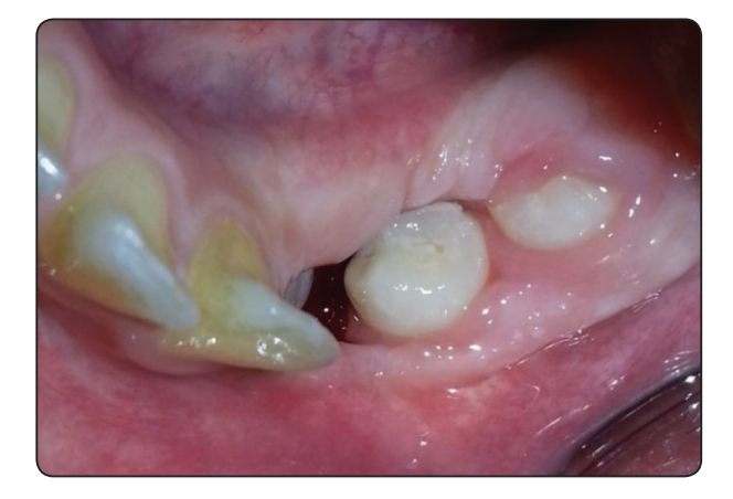
Fig (6) Clinical photograph showing the eruption of mandibular canine and premolar

Fig (5) b) Post-operative panoramic radiograph showing the eruption of maxillary and mandibular canine after cyst marsupialization and the appearance of a new cystic lesion related to mandibular right third molar