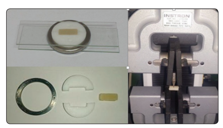
Fig. (1) Preparation and testing of the specimens.

Control group specimens were prepared by condensing the composite (G-aenial Posterior, GC DENTAL PRODUCTS CORPOR., Japan) into a white polytetrafluoroethylene (Teflon) split mold against a microscope glass slab, with a Mylar strip between the glass slab and the Teflon mold. A second Mylar strip and glass slab were stabilized in contact with the uncured composite and pressed to the thickness of the mold. The split molds were held together by an adjustable metal frame.