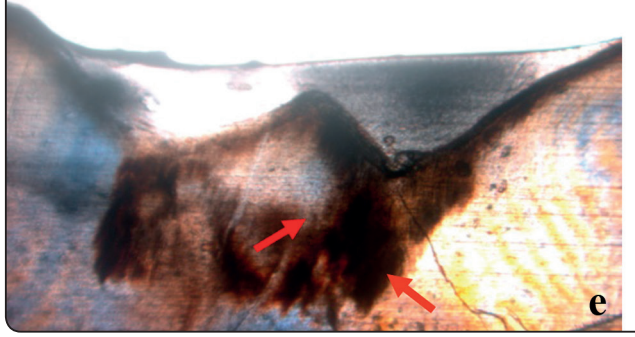
Fig. (1) Sample images of the sectioned teeth with various levels of tracer penetration. a: score 0, no tracer penetration; b: score 1; c: score 2; d: score 3 and e: score 4 showing tracer penetration to full depth of the fissure. Arrows indicating depth of tracer penetration.