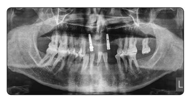
Fig (1) Panoramic radiograph showing the two implants with different platform designs