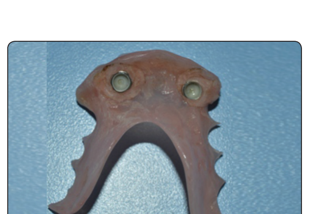
Fig (3) Finished partial denture after pickup of locator housings