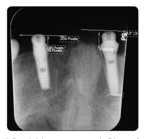
Fig (4) Bone height measurement on the Digora software

Bone height (Base line) – Bone height (Post-operative) x 100 Bone height (Base line)