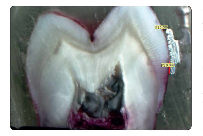
Fig. (1) A specimen with a metal bracket, demonstrating microleakage at the tooth-adhesive interface (magnification 12.5 X)

Step B: After bonding the brackets, thermocycling was performed at 5\pm2^{\circ} C to 55\pm2^{\circ} C for 500 cycles with a dwell time of 30 seconds, and a transfer time of 10 seconds. Step C: Before dye penetration, premolar apices were sealed with sticky wax. Moreover, specimens were coated with two consecutive layers of nail varnish up to