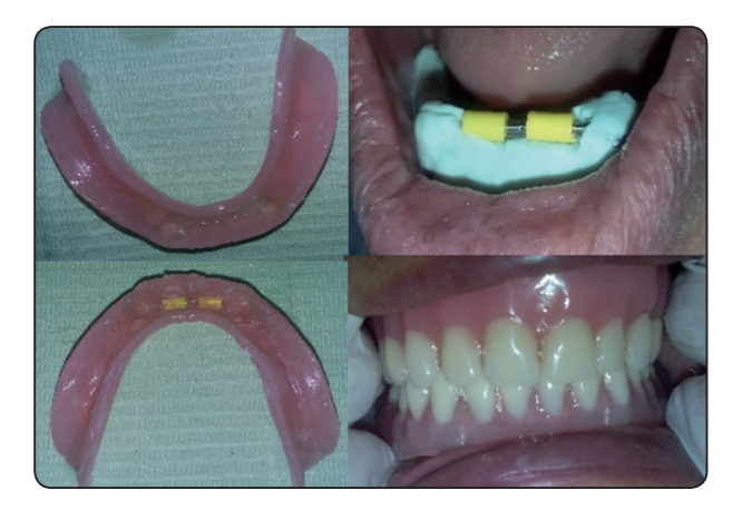
Fig (2) Pick up of retentive tip

Dentures were then fitted intra orally. Pick up of retentive clips for mandibular overdenture was done intra orally using autopolymerized acrylic resin (Fig 2). Sequence of wearing the two maxillary dentures was done randomly as mentioned before. Patients were recalled for follow up 24 hours after denture wearing, 3 days and one week later.