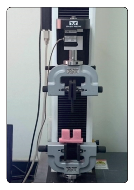
Fig. (1): The three point bending test

Table 1 show the results of the three point bending tests for the uncoated NiTi arch wire at the different loading and unloading stages. There was higher loading forces after sterilization compared to before at loading deflections of 1mm and 2 mm in uncoated NiTi wire with statistically significant difference (p<0.05). However, it showed lower loading forces when deflected for 3mm after sterilization with no statistically significant difference (p>0.05). Uncoated nickel titanium wire