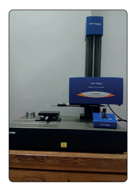
Fig. (2): The surface profilometry