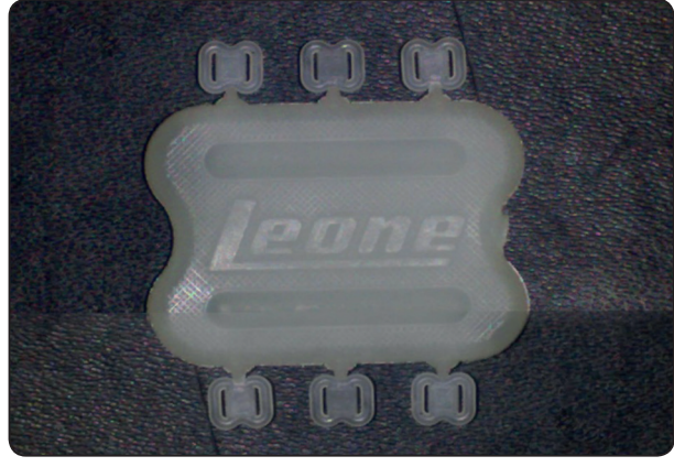
Fig. (4) Unconventional ligation (slide low friction system) (Leone orthodontic product, Italy).