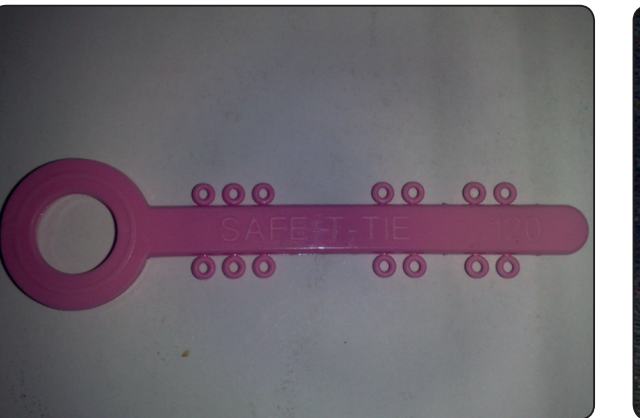
Fig. (3) Conventional elastomeric ligature (Ortho organizer product).