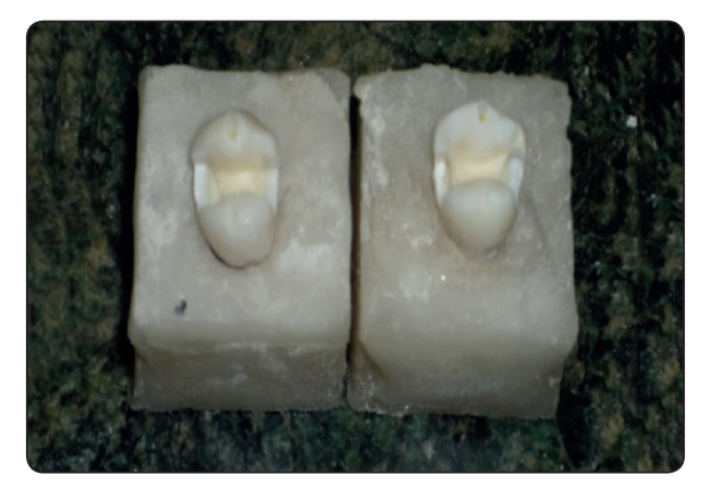
Fig (1): MOD cavity preparation