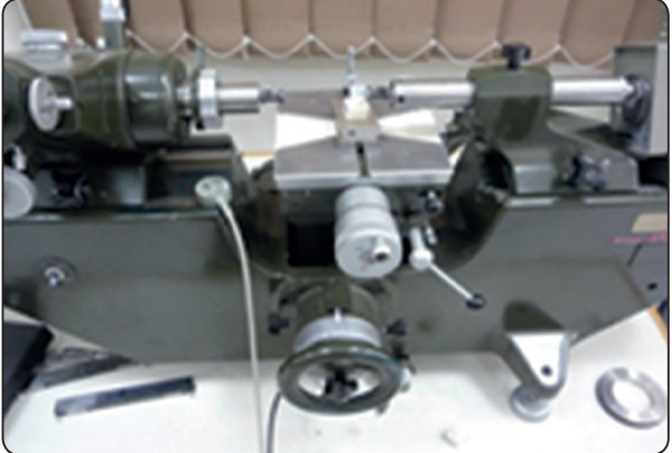
Fig (2): Universal horizontal metroscope