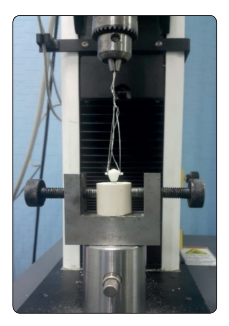
Fig. (3) Retention measurement procedure